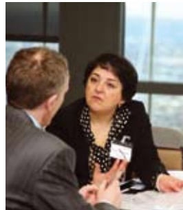
In the informal networking area, against the stunning and inspiring skyline of London, constructive and animated discussion took place throughout the day.

The SMEs present were invited because the goods and services they provide appear to match sectors in which corporate members currently buy or are likely to buy in the future.